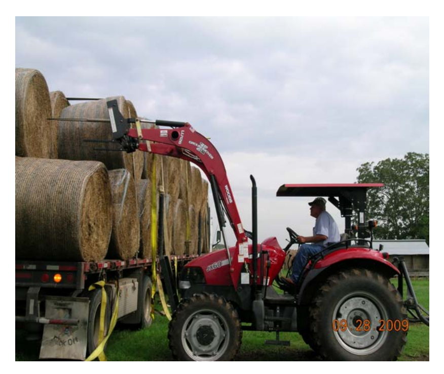
Hay brought in by De-Go-La delivered to Jackson County.